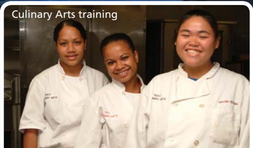
Culinary Arts training